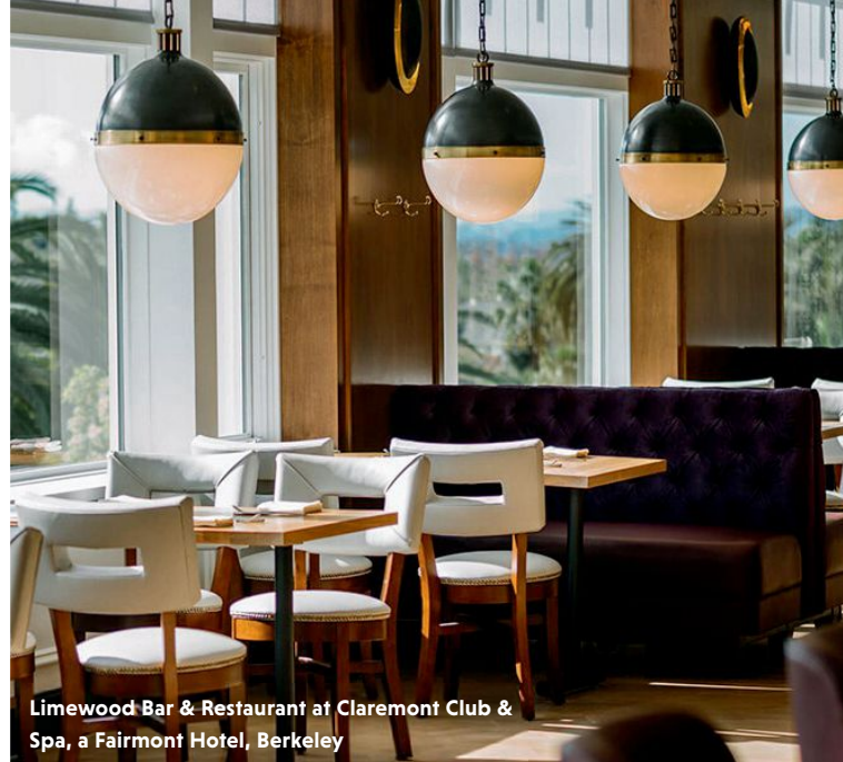
Limewood Bar & Restaurant at Claremont Club & Spa, a Fairmont Hotel, Berkeley