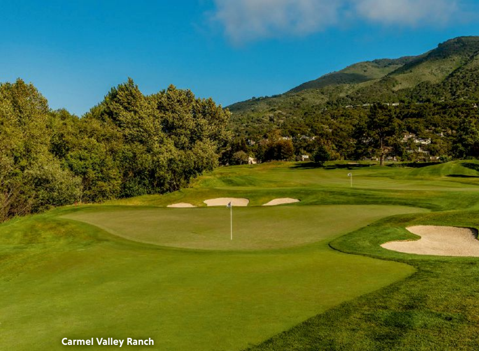
Carmel Valley Ranch