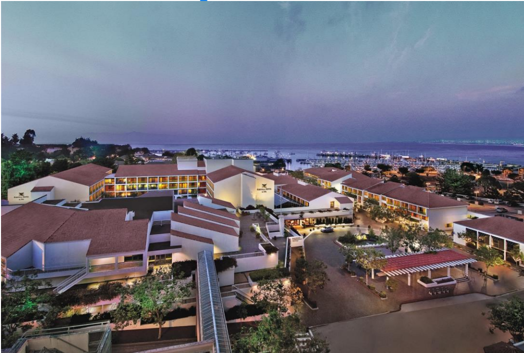
Portola Hotel & Spa

Absorb the energy of the vibrant Monterey as you get cozy in a guest room at Portola Hotel & Spa. This premier waterfront hotel - located in historic downtown Monterey - offers the ultimate comfort and convenience to its guests.