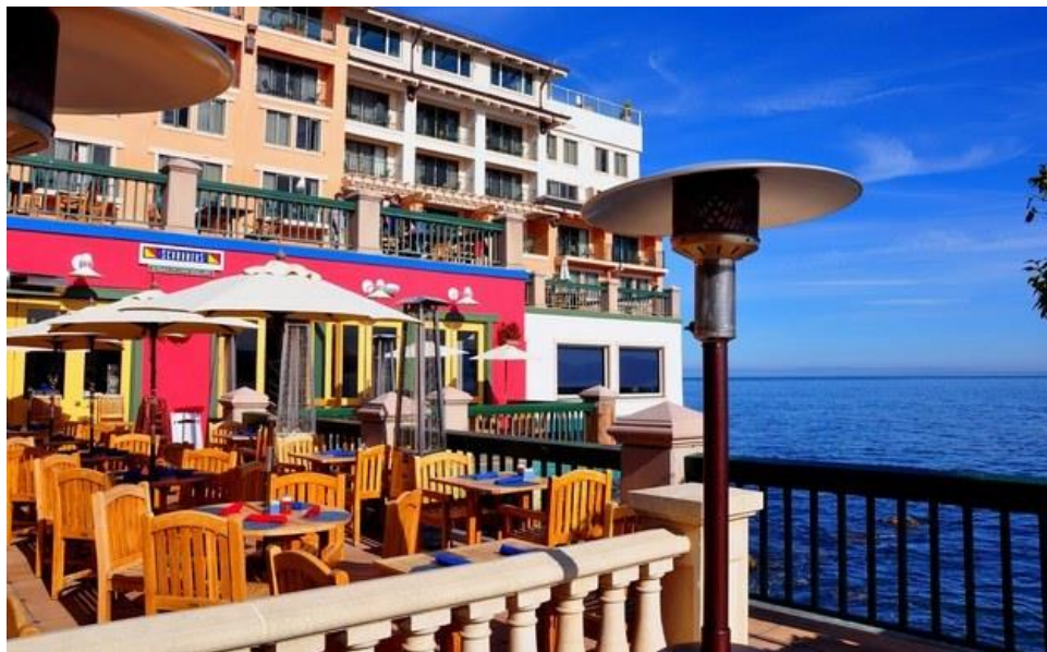
Schooners Coastal Kitchen & Bar