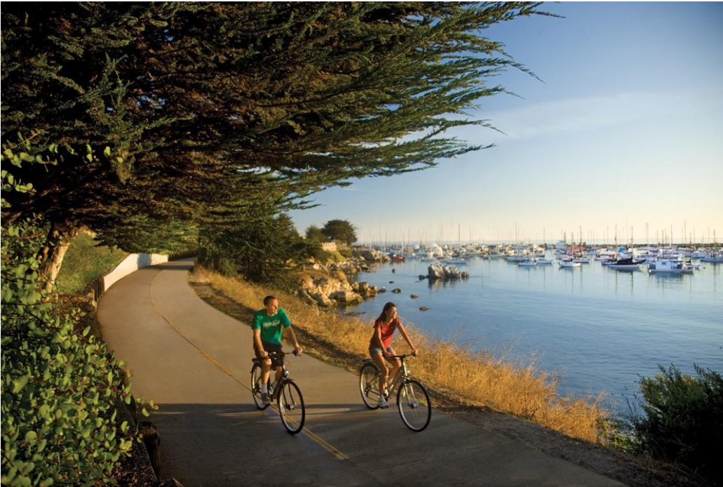
Portola Hotel & Spa

Whether you are an experienced cyclist who wants to explore the rugged, off-road trail or a beginner who seeks a gentle ride on a paved coastal trail, you can rent a two-wheeler to journey through the terrains of Monterey Bay. Easily hop on and off to bask (and take pictures!) in the natural beauty of the path. Enjoy the freedom and flexibility of being on a bike to venture out to wherever you want at your own pace.