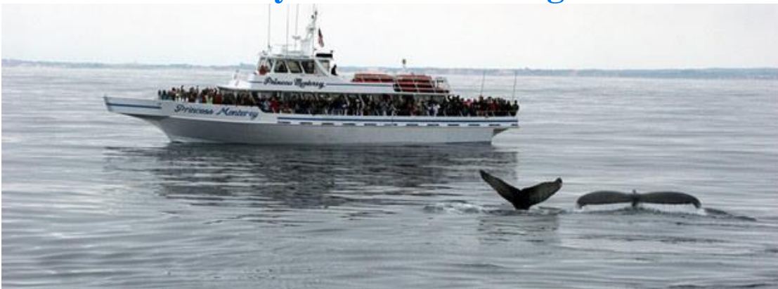
Princess Monterey Whale Watching

A city that bustles with rich marine life, Monterey is the place to fulfill your dream of watching the majestic giants of ocean. Princess Monterey Whale Watching offers fully narrated whale watching and nature tours year-round. Enjoy the opportunity to view the marine life of the Monterey Bay, including gray whale, dolphins, and sea otters, while relaxing in the modern amenities of Princess Monterey's large vessel that includes indoor heated cabins and snack bar.