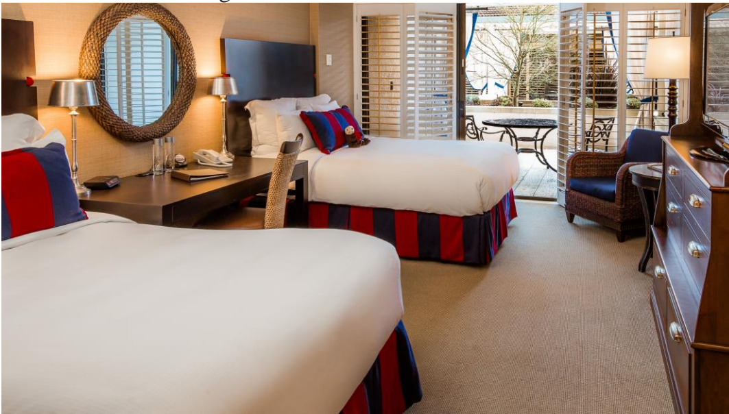
Portola Hotel & Spa

Absorb the energy of the vibrant Monterey as you get cozy in a guest room at Portola Hotel & Spa. This premier waterfront hotel - located in historic downtown Monterey - offers the ultimate comfort and convenience to its guests.