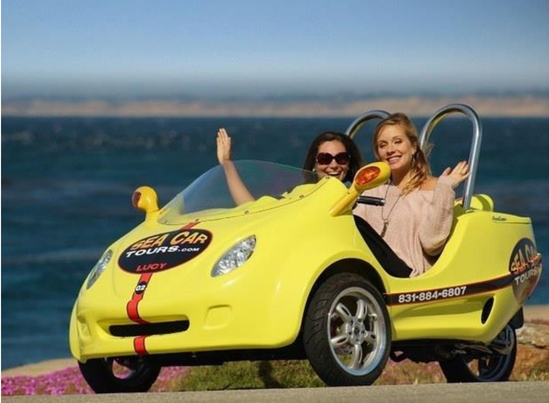
Sea Car Tours

Ditch those boring ol' tour buses and hop on the adorable, yellow scooter car for the best way to explore Monterey! Sea Car Tours offers a fun cruise along Monterey's most beautiful destinations in the convertible Sea Car, which steers like a scooter, but provides the comfort of a car. You can opt for a one, two, or three hour narrated tour (GPS-driven!) that includes visits to places like Fisherman's Wharf, Cannery Row, and Lover's Point. Each Sea Car sits up to two people.