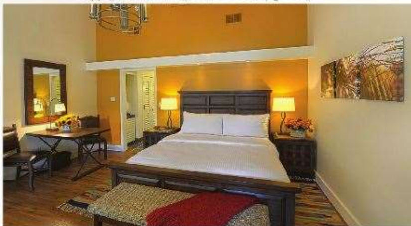
All Quail Lodge guest rooms have complimentary Wi-Fi and an iPad docking station.