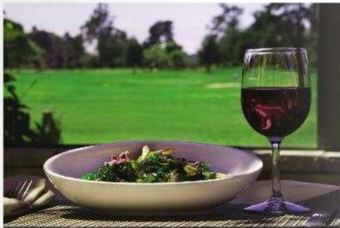
Enjoy a glass of wine with Edgar's kale salad.

Jacks Restaurant & Lounge in Monterey is a great reason to explore a little farther north.