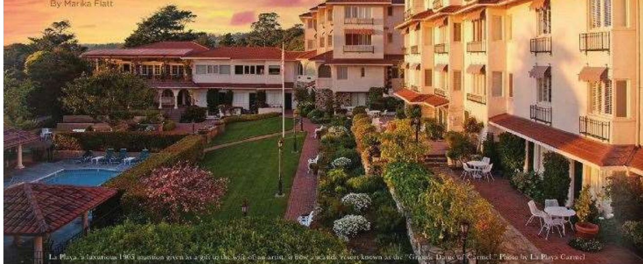
La Playa, a luxurious 1905 mansion given as a gift to the wife of an artist, is now a seaside resort known as the "Grand Dame of Carmel."

If you're a golfer, you likely have Pebble Beach Golf Club on your bucket list, which makes Carmel-by-the-Sea a golfer's paradise. Carmel , as I like to call it, is a popular destination for Texans because, well, who wouldn't want to experience the charm of a place by the sea?