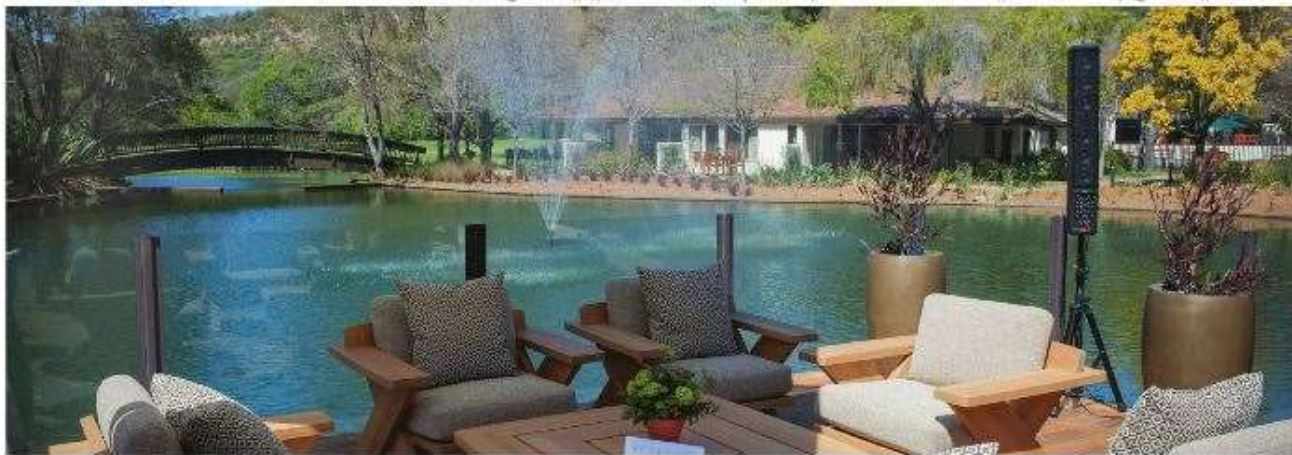
Enjoy the natural scenery at Quail Lodge & Golf Club and disconnect from the world for a while.