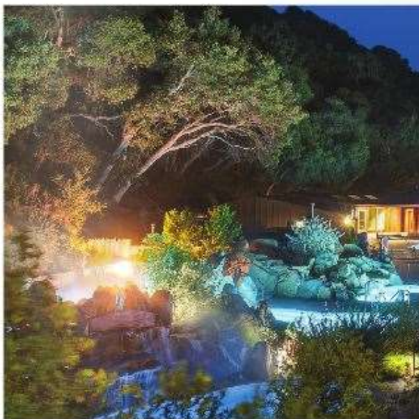
The Refuge is a quiet retreat and co-ed day spa.

The final score? Our double date golf adventure was full of memories that will last a lifetime. And, our friends have already made their reservation to return next year. If that's not a testament to Carmel's gravitational pull, I don't know what is.