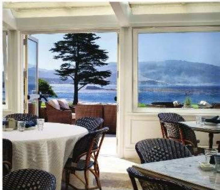
The Bench at Pebble Beach gives guests each lunch a spectacular view overlooking the 18th hole at Pebble Beach Golf Links.

The four golf courses along the famed 17-mile drive that make up Pebble Beach see more visitors from Texas than any other state. Guests can stay at The Lodge, the Inn at Spanish Bay or the boutique 24-room Casa Palmero, which sits next to the five-star spa. There's even an equestrian center at Pebble Beach! (Read more about golfing Pebble Beach in the sidebar.)